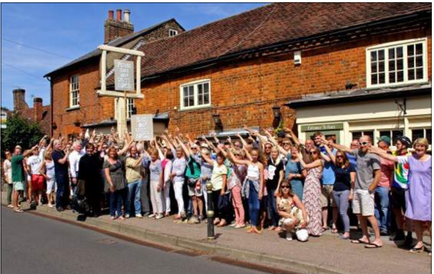
Villagers gathered a few years ago to protest about the closure of the White Horse

The "Save Our White Horse Community Group".