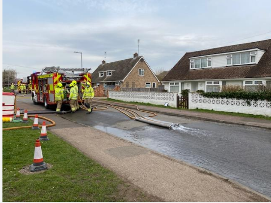
Wet test in Claggy Road