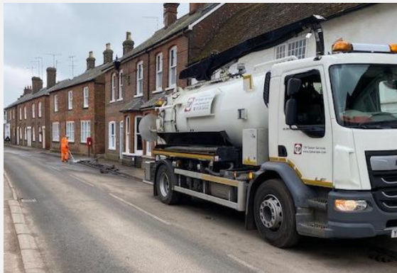
Gully Cleaning in High Street

This groundwater flow most likely relates to rainfall events which are not recent (possibly months ago) and is slower to respond to rainfall than rivers but can last for a long time. It is extremely problematic to manage as it covers significant areas and large volumes of water.