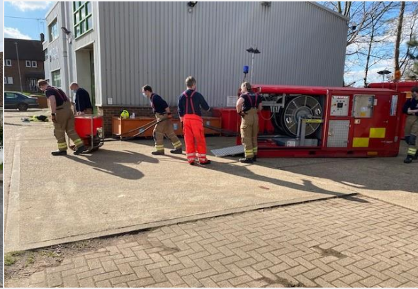
Fire crew testing pumps

During March, ground water levels stopped rising and have remained fairly static over a 20-day period. It is now unlikely that flooding will occur this year but if higher than normal rain fall occurs later this year, it would result in a very real risk of flooding to the village in 2022. We are currently awaiting for HCC to issue a considered action plan that would be available to implement if the same risk occurs in future years.