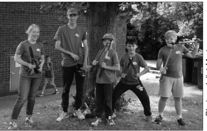
Lots of hard work! Noise Project 2016