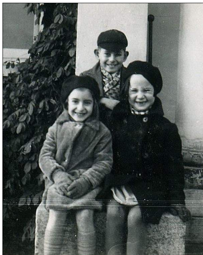
Refugee children from London at Lawrence End in 1939