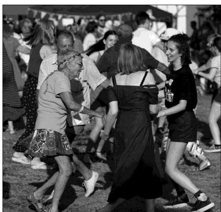
Folk Festival